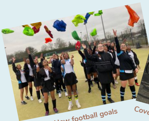
New football goals