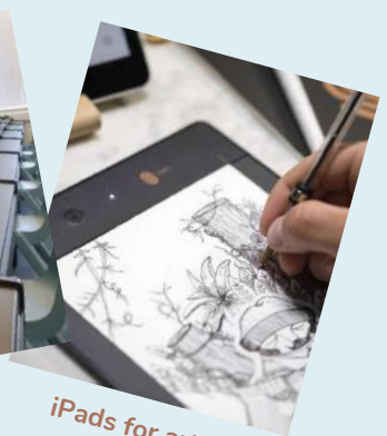
iPads for art