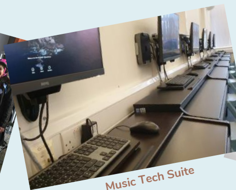
Music Tech Suite