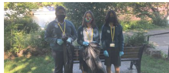
Year 8 getting involved in the Great British Spring Clean with @KeepBritainTidy

An outline figure suggests that some 5,000 hours of charitable work has been completed by students, having a significant impact on the wider community.