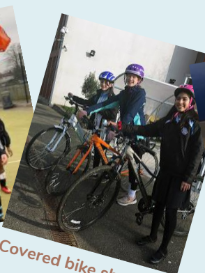
Covered bike shelters